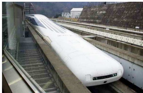
The Maglev Train...

The Japanese have already created a high speed train working off a magnetic line.