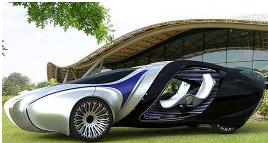
Super Green Magnetic Cars