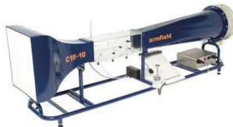
A Basic Wind Tunnel Structure...

Wind tunnels can also be used. This is done with a simple fan enclosed in a tunnel that spins every time the vehicle moves.